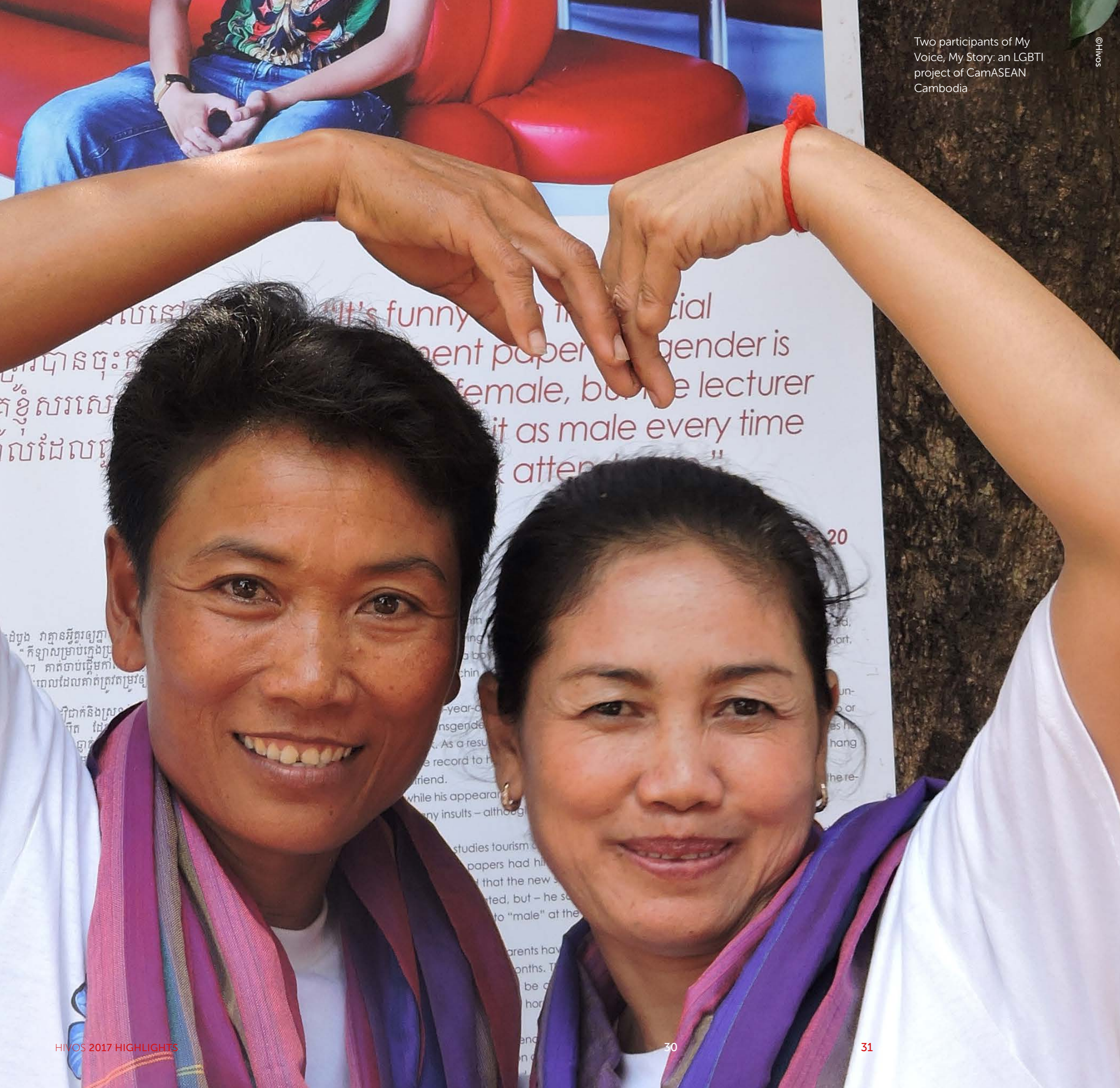
Two participants of My Voice, My Story: an LGBTI project of CamASEAN Cambodia