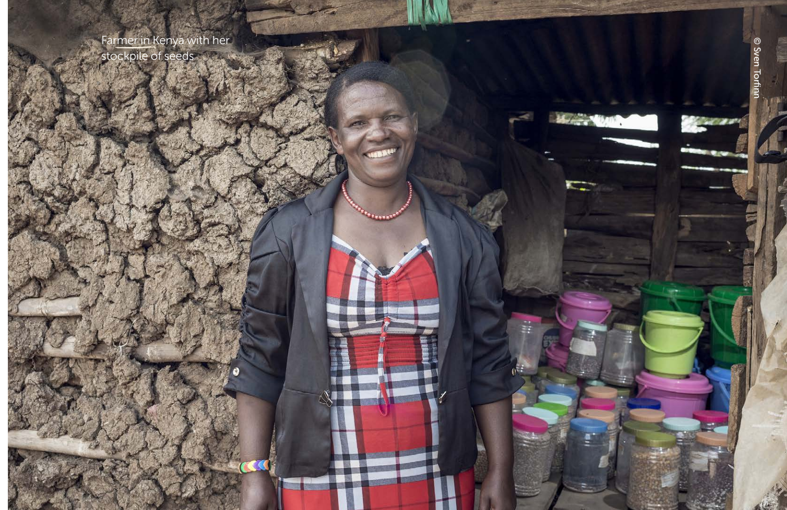
Farmer in Kenya with her stockpile of seeds

Hivos promotes and initiates open-source seed systems in which farmers have the freedom to save, breed and sell seeds, thus allowing them to increase