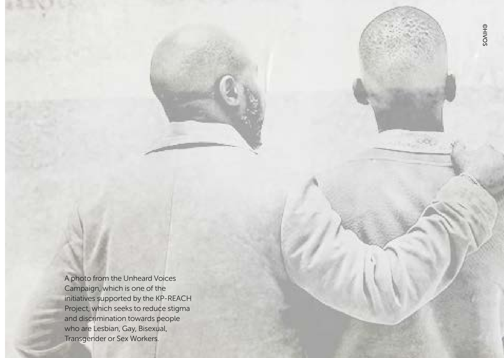
A photo from the Unheard Voices Campaign, which is one of the initiatives supported by the KP-REACH Project, which seeks to reduce stigma and discrimination towards people who are Lesbian, Gay, Bisexual, Transgender or Sex Workers.

This revelation and five other key findings that came from the working group's testing of hypotheses and creative concepts proved that the winning route was role-modelling change of 'people like them'. In real life this meant: telling stories that touched on universal feelings and emotions, humanising key populations, and at the same time leveraging positive values. The stories told were disruptive stories to remind people – especially the 'moveable middle' – of their belief in being non-judgemental and in the common humanity of all people, and to help them to reconcile and adopt new behaviour, embracing LGBT people and sex workers.