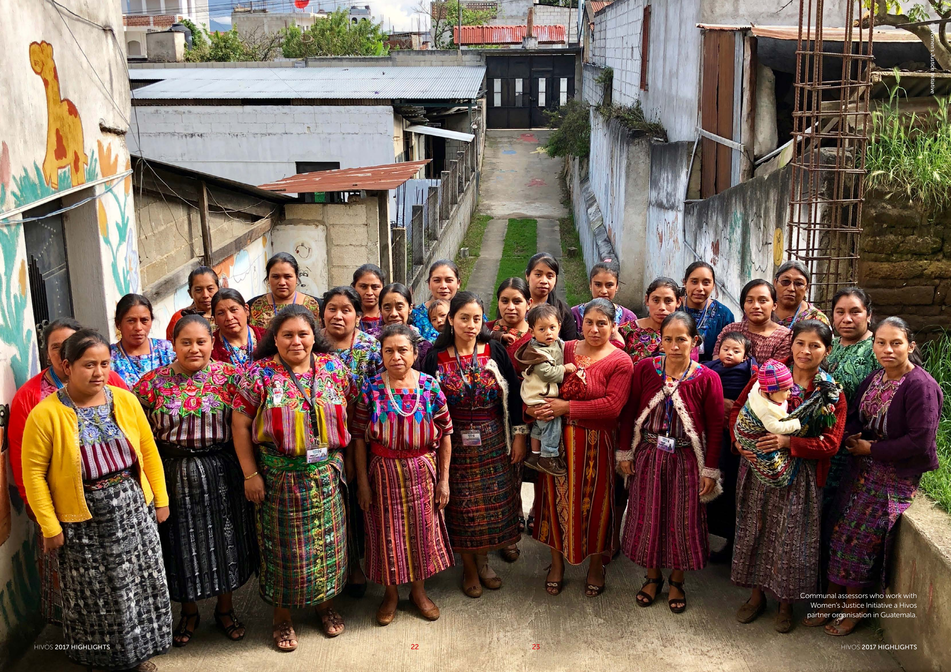
Communal assessors who work with Women's Justice Initiative a Hivos partner organisation in Guatemala.