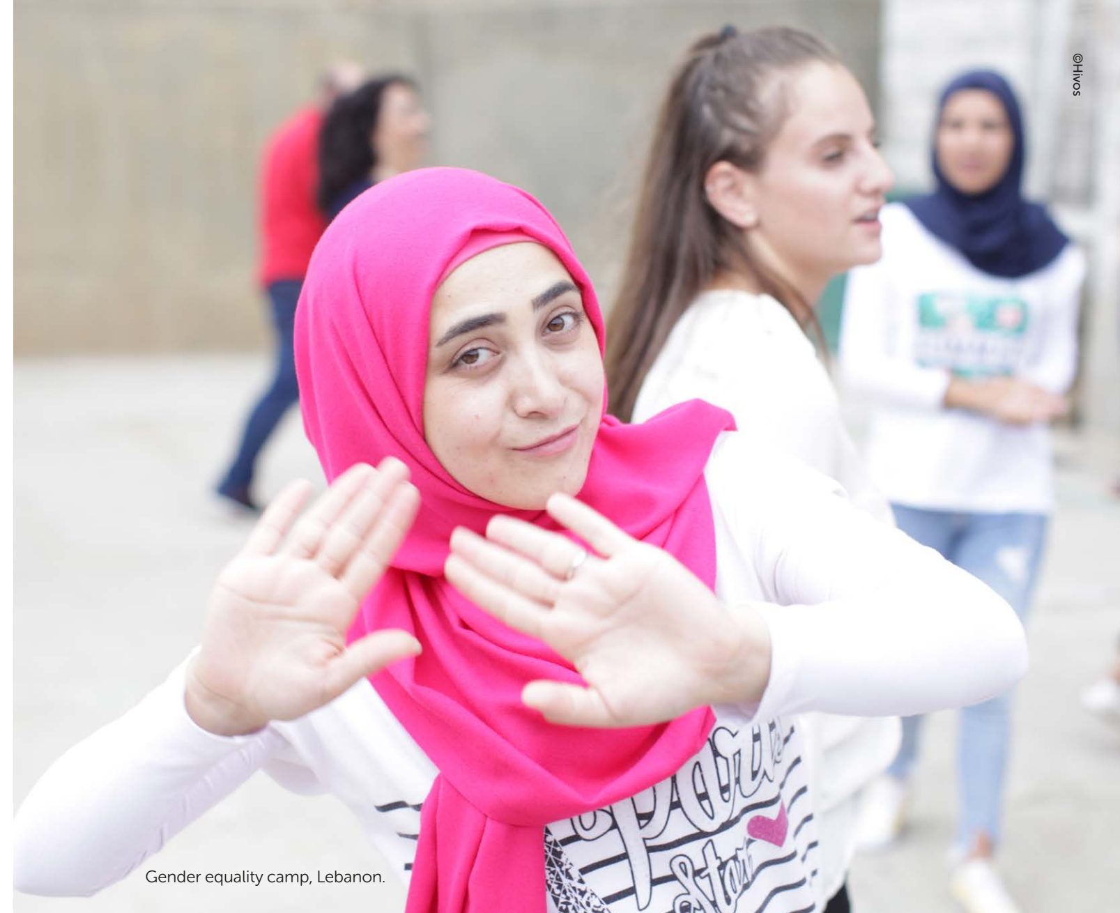
Gender equality camp, Lebanon.

As a result, linking clearly prevailed over learning in Zimbabwe. This is a lesson learned that we will bear in mind for the next event. However, there were still some important learning moments. One of these was the gender barometer, which serves as an important lobbying tool for women in Southern Africa, and will now be adapted for use in the Middle East. This evidence-based tool provides information on the real political and economic participation of women in a country or region.