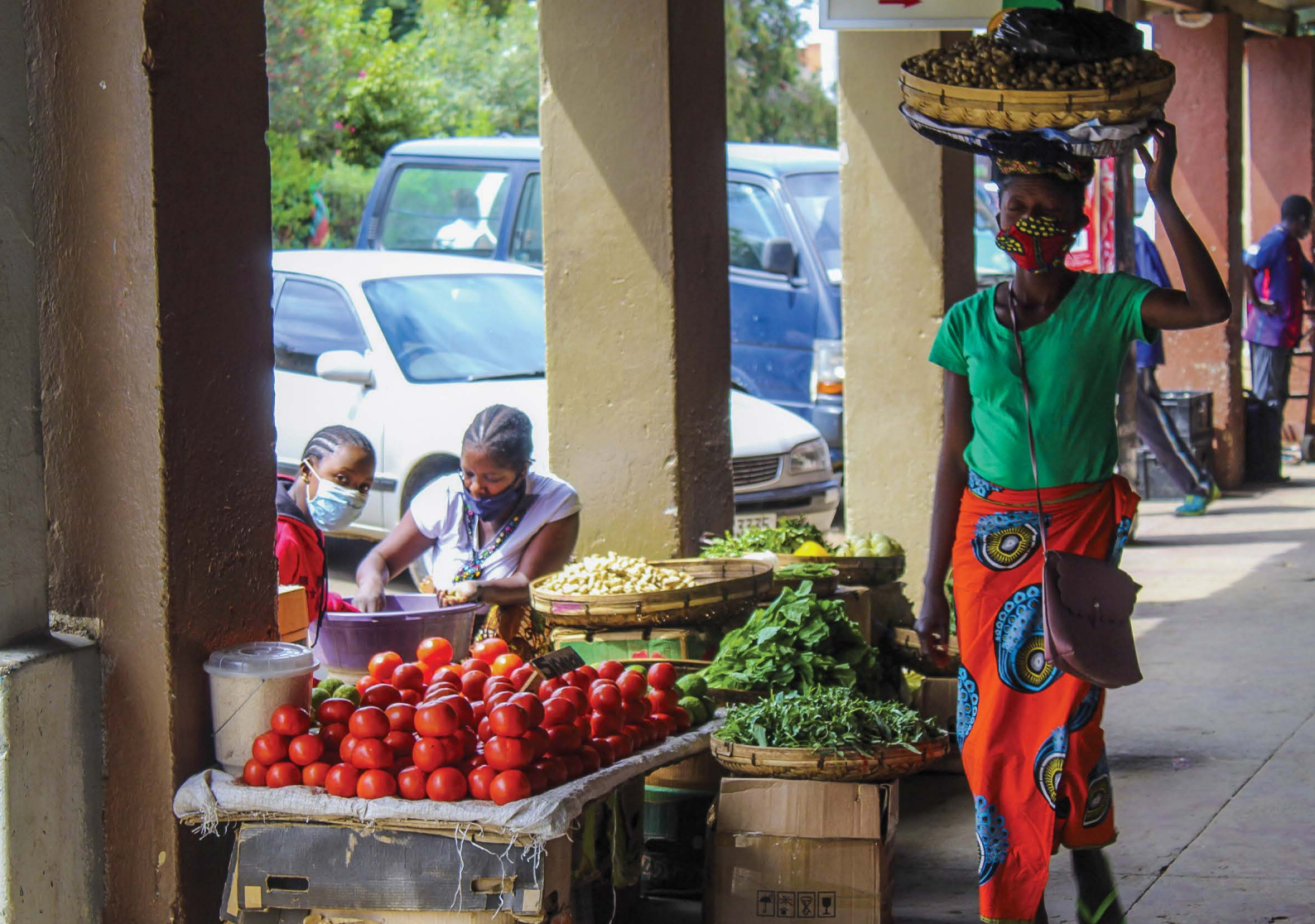
Informal market actors working in the midst of COVID-19 pandemic