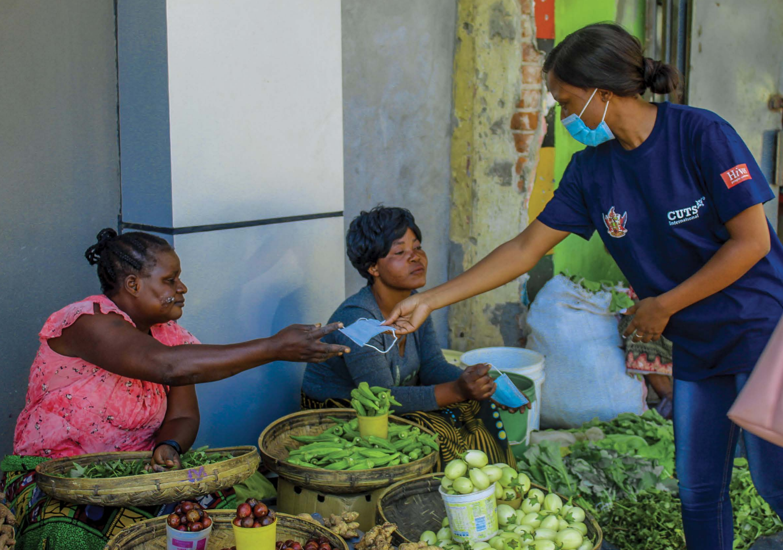
In Zambia, partner CUTS initiated a campaign with the Lusaka City Council to inform visitors of informal markets about the pandemic, consumer protection and the right to food

agriculture, in particular to shift agricultural subsidies away from maize towards a broader range of more nutritious and diverse food crops. Anticipating the government’s economic recovery packages, they have launched a report on the impact of COVID-19 on the country’s food diversification agenda. The report emphasises the need for recovery and economic stimulus packages to be in line with the government’s existing food diversification strategy beyond the sole production of maize, and to be oriented towards building greater resilience in the food production system.