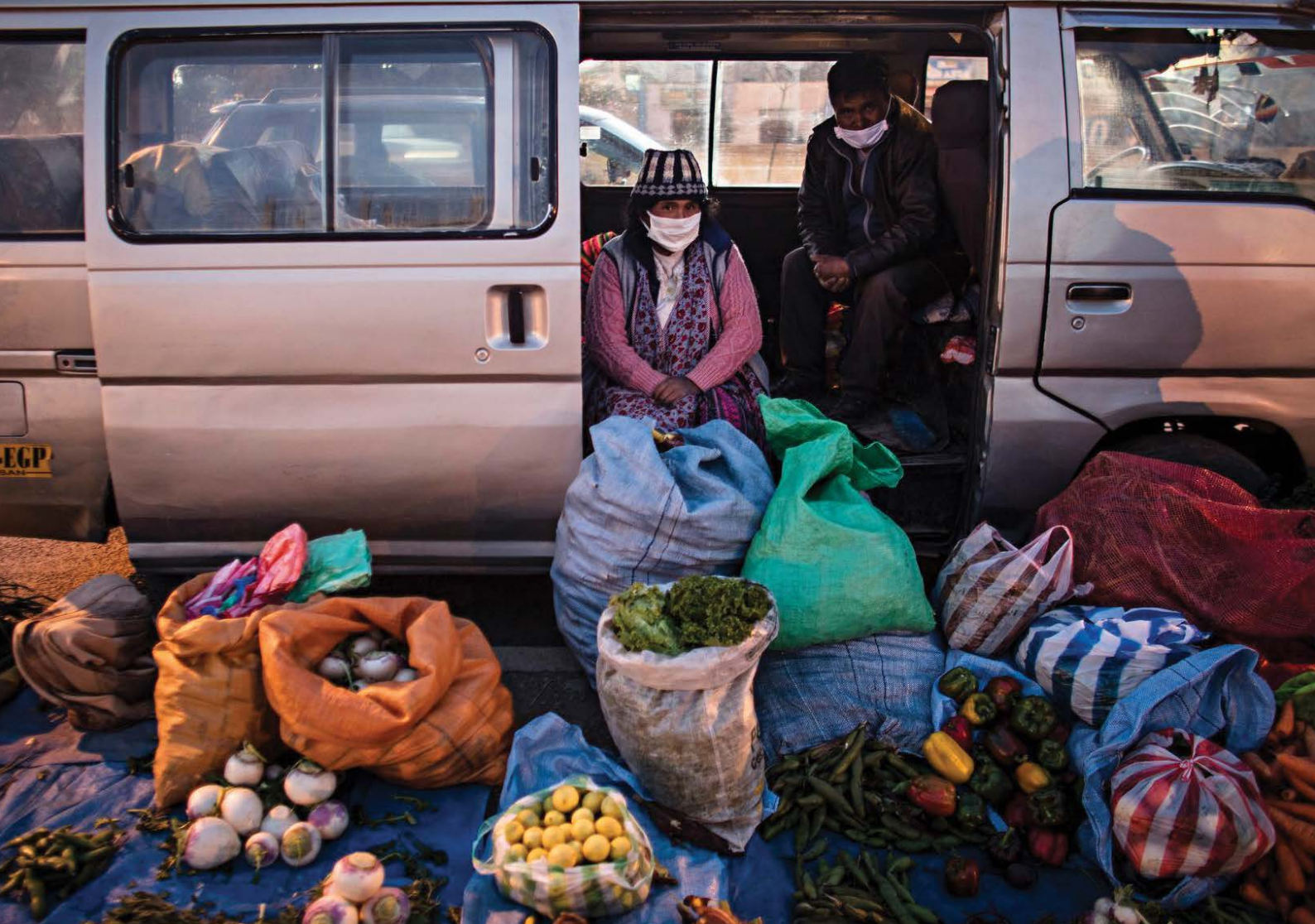
“Pucarani” market in El Alto, Bolivia: ‘mobile markets’ offer vegetables and fruits to inhabitants of different low-income neighbourhoods where local markets have been closed

consumers , and in linking the urban poor with key local markets for fresh fruit, vegetables and meat. Informal food markets inherently include many different actors, and are rich in diversity of goods, qualities and quantities. Despite their central role, informal markets are commonly marginalised or ignored by public policy. Informal food markets are critical to ensure food provisioning for 90% of poor households in Zambian cities. When informal markets in Zambia were closed due to the COVID-19 crisis SD4All partner Consumer Unity & Trust Society (CUTS) , with the Lusaka City Council, developed an information campaign to inform visitors of informal markets about the pandemic, consumer protection and the right to food. Partner Alliance for Zambia Informal Economy Associations (AZIEA) has called on the government to implement social protection programmes that can guarantee the health of both the economic and social livelihood of informal market actors. As the government is preparing the development of a COVID-19 recovery fund for small (formal and informal) businesses, additional research done by Hivos on the impact of COVID-19 on informal markets in Zambia has found that only a small portion (4%) of informal market actors were actually informed about the fund. Next steps on the